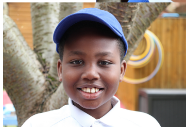
Prep Hat - Years 3+