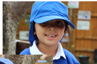
Nursery and Pre-Prep Hat (Nursery to Year 2)

Please note that smartwatches are prohibited in school.